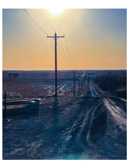
These pictures taken in the Covert substation area are about eight hours apart. There were approximately 30 poles down on this section of line that needed to be replaced. Kudos to our crews who work hard to get power restored to our members as quickly as possible!

safely to restore power. Also, a big thank you to our crews who were out working in the harsh and dangerous conditions, working long hours to restore power to our members.